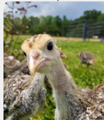
Bull City Farm