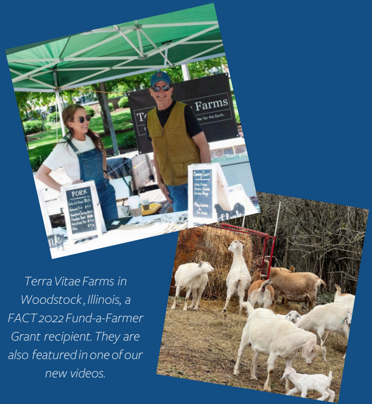
Terra Vitae Farms in Woodstock, Illinois, a FACT 2022 Fund-a-Farmer Grant recipient. They are also featured in one of our new videos.