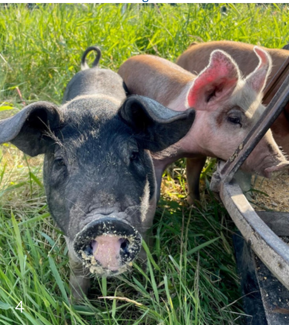
Rue de Bungalow Farm