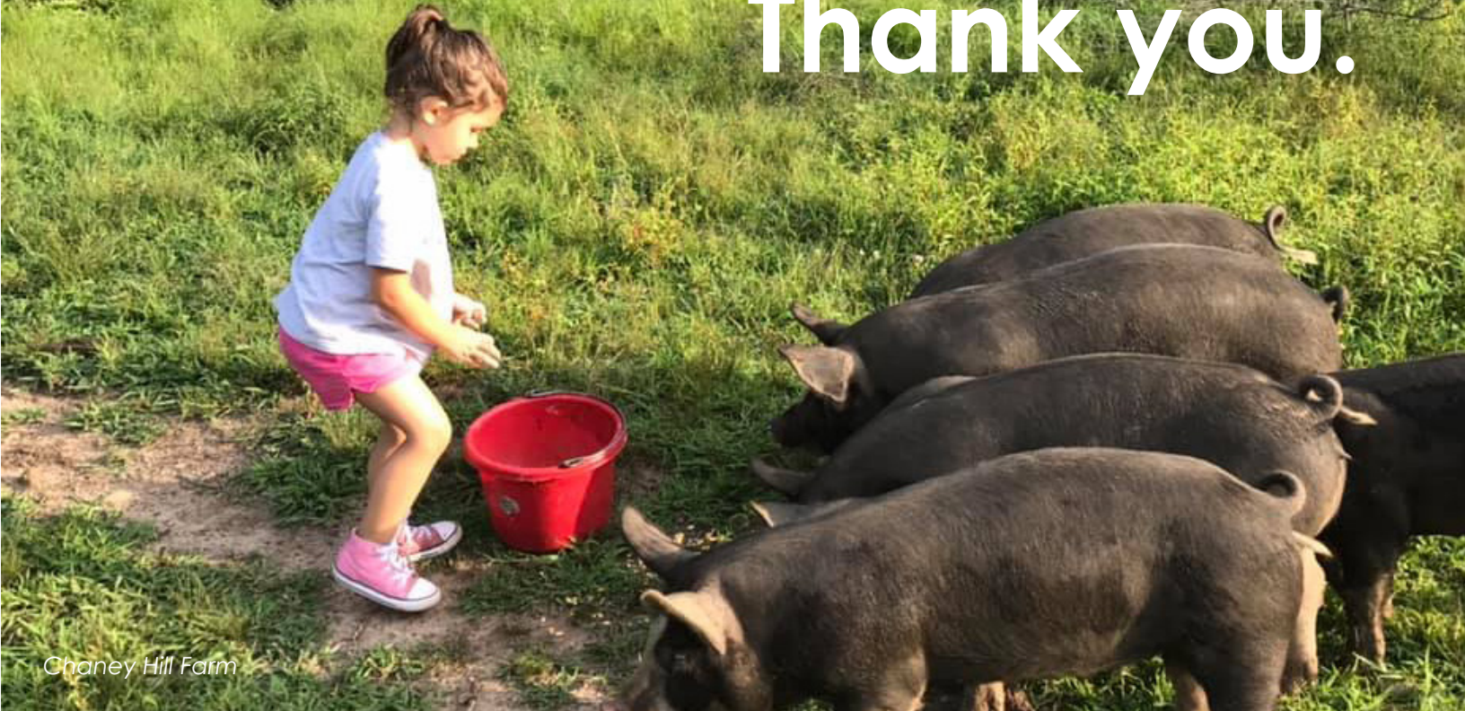
Chaney Hill Farm

FACT appreciates the generous support of our donors. Without you none of our work detailed on the previous pages would have been possible. Below is a listing of donors who contributed between January 1 2022 through December 31, 2022.