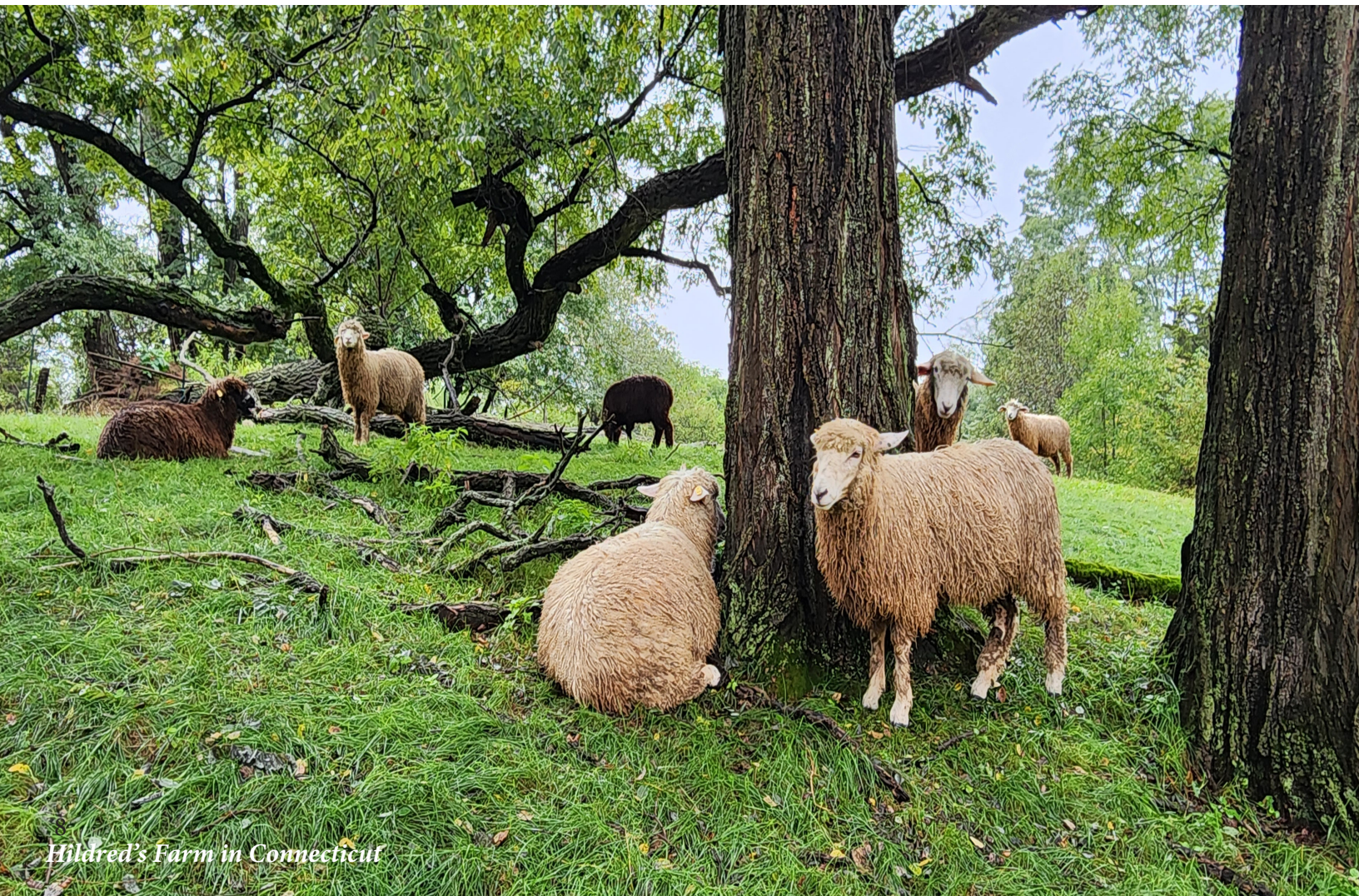
Hildred's Farm in Connecticut

773-525-4952 www.FACT.care info@foodanimalconcerns.org