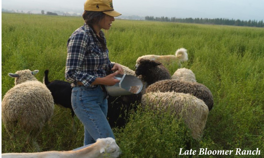
Late Bloomer Ranch

“Expanding the available space in a pasture offers significant advantages to poultry farming, positively impacting both the well-being of the birds and overall sales for our business. With increased space, poultry can exhibit and engage in more natural behaviors, and experience reduced stress levels. This enhanced environment promotes better health, resulting in improved growth rates and higher-quality meat. From a sales perspective, the improved well-being and superior quality of our poultry due to increased pasture space can attract consumers who prioritize ethically raised and high-quality meat. Meeting the demand for our products can lead to a competitive edge in the market, foster customer loyalty, and drive overall sales growth.”